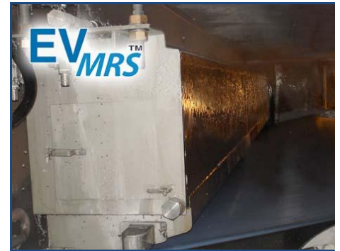
EV MRS at bottom wire

This caused contamination on machine constructions and frames, and defects because of dropping water and filler clumps.