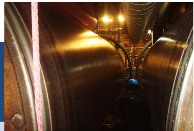
After: Cylinder surfaces are as good as new

“EV ReDoc has cleaned properly all cylinder surfaces.”