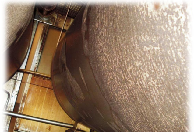
Before: Very dirty cylinder surfaces

The mill personnel is happy with the cleaning results. EV ReDoc has eliminated the dirt that was accumulated on the cylinder and calander surfaces over the years. Thanks to clean cylinder surfaces, drying is now more efficient and requires less energy than before. Also, the quality of the paperboard is improved. After the cleaning, the cylinder surfaces are still pretty clean after one year production time.