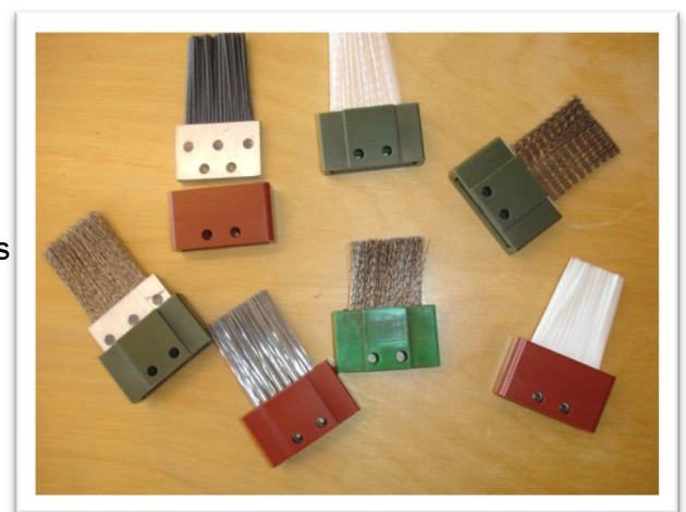
EV ReDoc brush types

The electricity consumption of EV ReDoc is only minimal, as the brushes and the chain are operated by a small motor (0.18 kW).