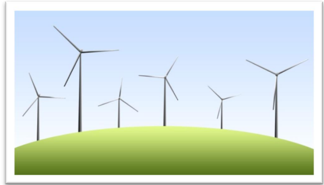
PM 7 recovers now 10 MW of heating energy. The same amount of energy could be produced with 16-17 big wind mills.

PM 7 needs now also 10% less steam consumption in drying.